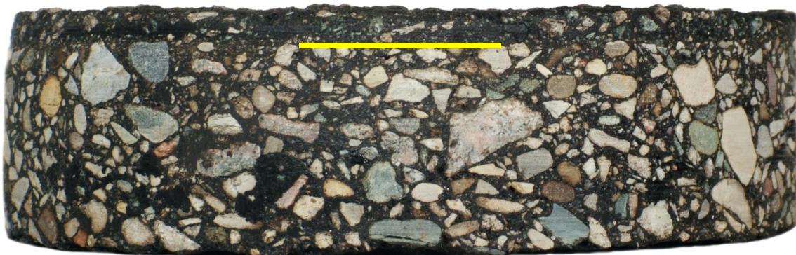
Typical Surface Treatment 3/16" - 3/8" Over existing asphalt pavement