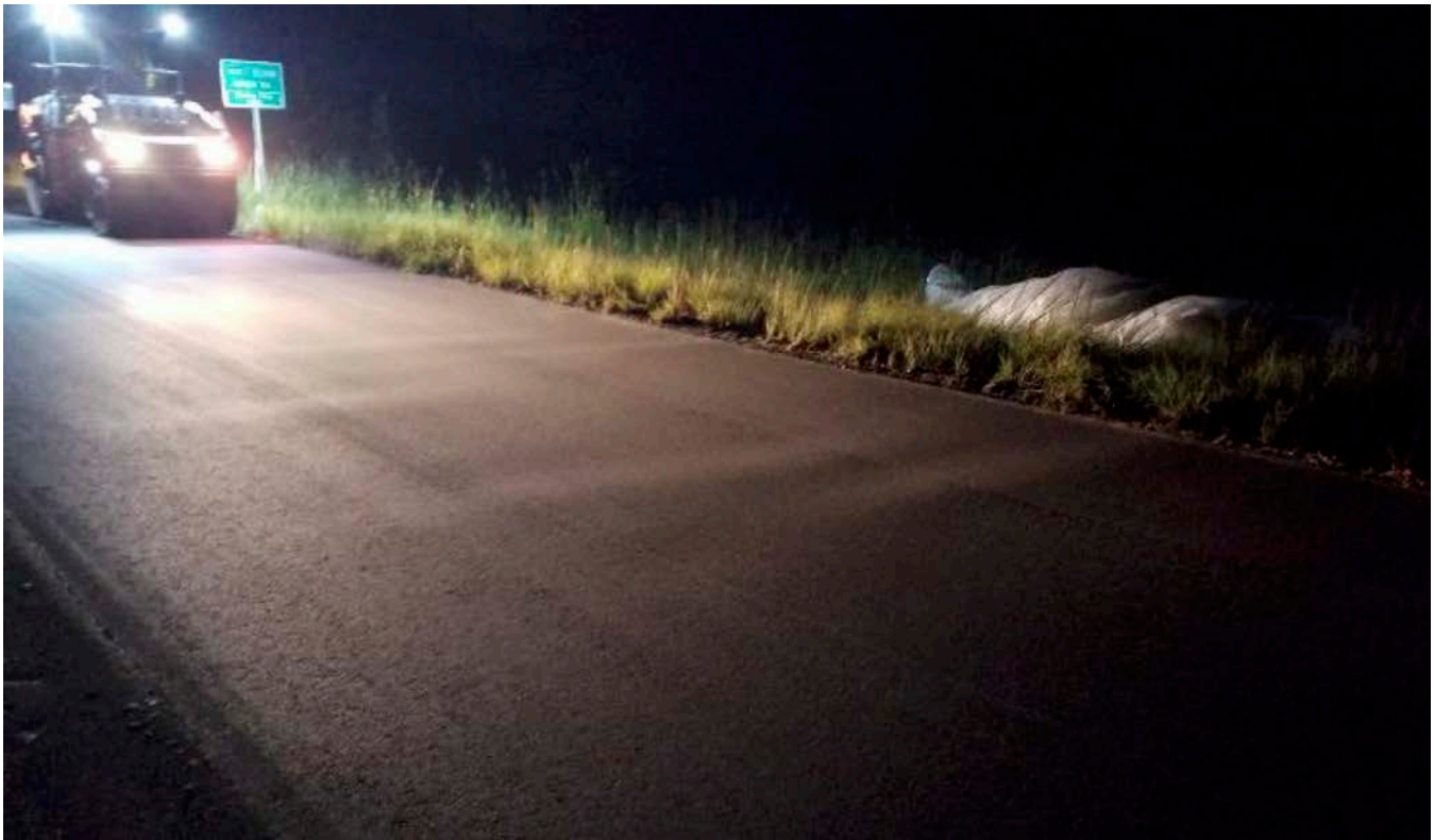
Thick lift paving in 2020 on South Carolina Highway 544 at night with a dual lane closure.

Highway 544 was a five-lane curb and gutter roadway, which provided the ideal confinement for achieving good densities. Because it was possible to setup a dual lane closure, there was room for equipment to pull on and off the new mat in a manner that minimized surface irregularities. Full coverage diamond grinding (required for the first time ever by SCDOT) was utilized to reduce roughness from just under 100 inches per mile to the 30s. The contractor won paving awards from the South Carolina Asphalt Pavement Association and the International Grooving & Grinding Association (IGGA) for this project.