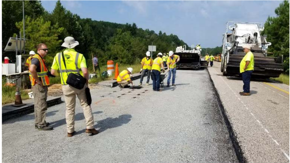
Installing instrumentation for thick lift paving in SCDOT's Test Track Section S9.

Research has shown that the minimum thickness of a plant-mix asphalt paving lift should be three times the nominal maximum aggregate size (NMAS) of the aggregate blend for fine-graded mixtures and four times the NMAS for coarse-graded mixtures. Lift thicknesses thinner than this are difficult to compact due to aggregate packing. However, there is little guidance on a maximum lift thickness.